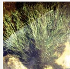
Spikerush Eleocharis sp.