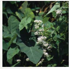
Wild taro Colocasia esculenta