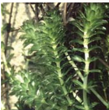
Hydrilla Hydrilla verticillata