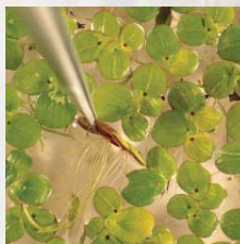
Duckweed Spirodela polyrhiza