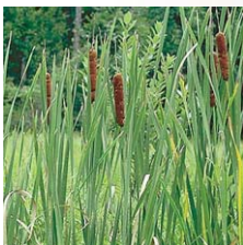
Cattail Typha sp.