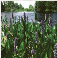
Pickerelweed Pontederia cordata