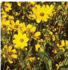
Bur-marigold Bidens laevis