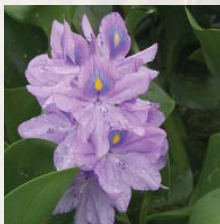
Waterhyacinth Eichhornia crassipes