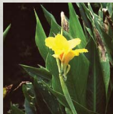
Golden canna Canna flaccida